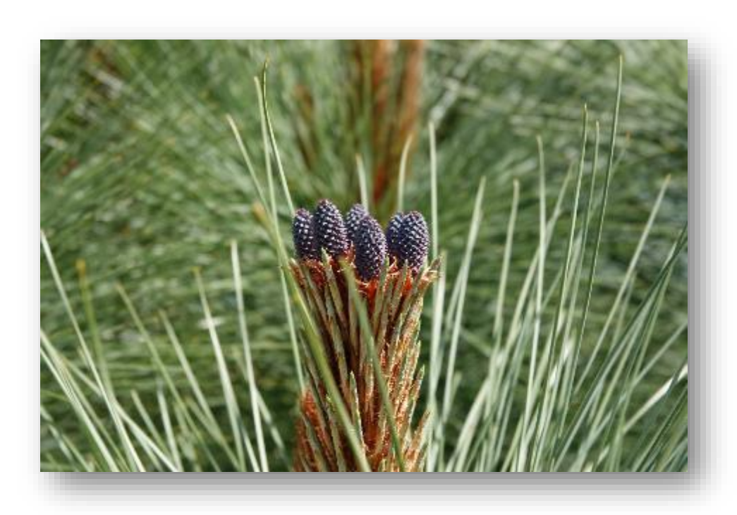
Name that Plant

The windows bloom with tulips — At dusk there's candlelight. The knotted oak beside it, Is webbed with ivy leaves, And honeysuckle tangles, In clusters round the eaves. The friendly gate swings open, Against a low stone wall, Where quaint old fashioned blossoms, Design a paisley shawl; And up the winding pathway, The stone with moss are grown — I love that little cottage, Because it is my own.